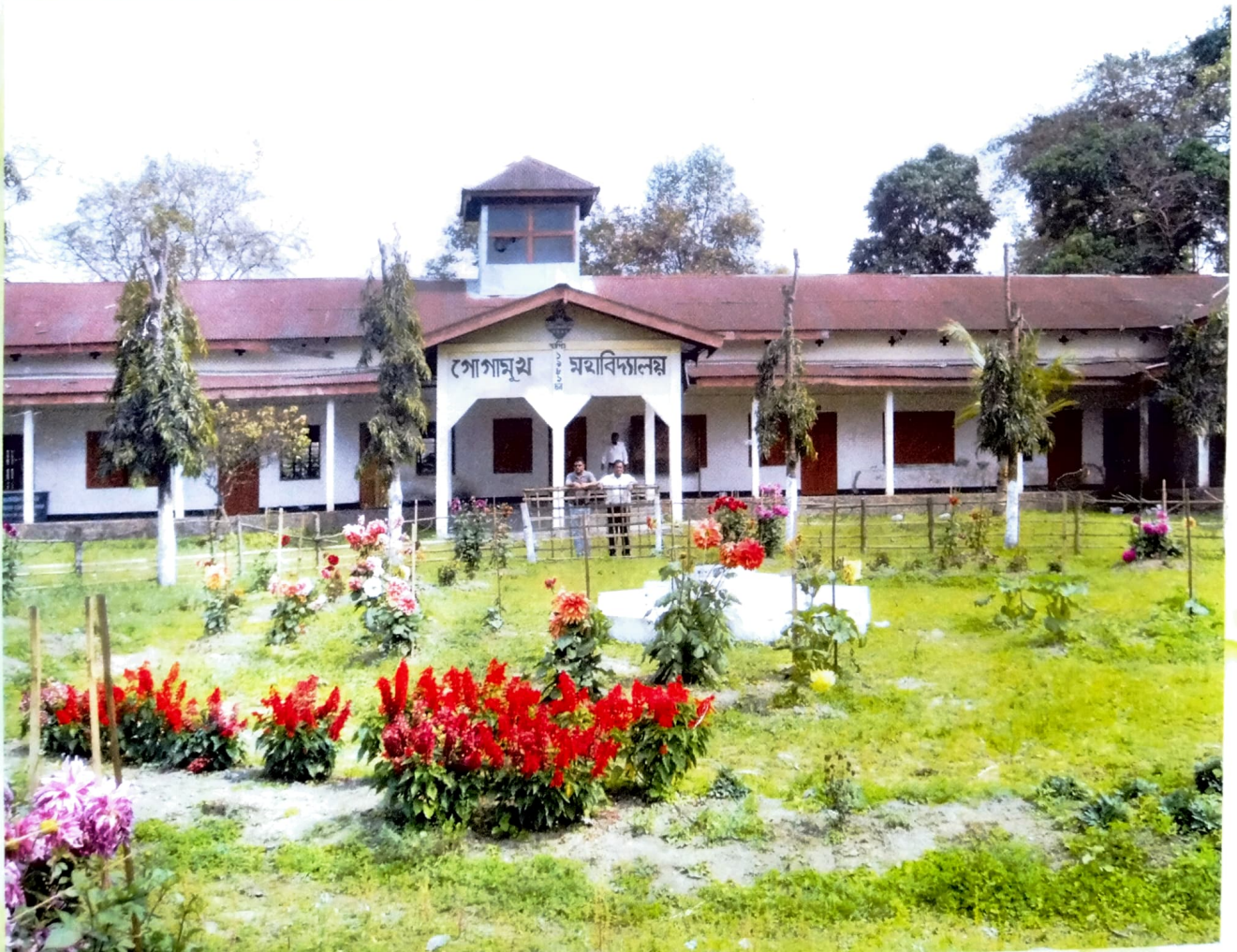
Printed at : Senapati Printers, Gogamukh; Dhemaji (Assam).