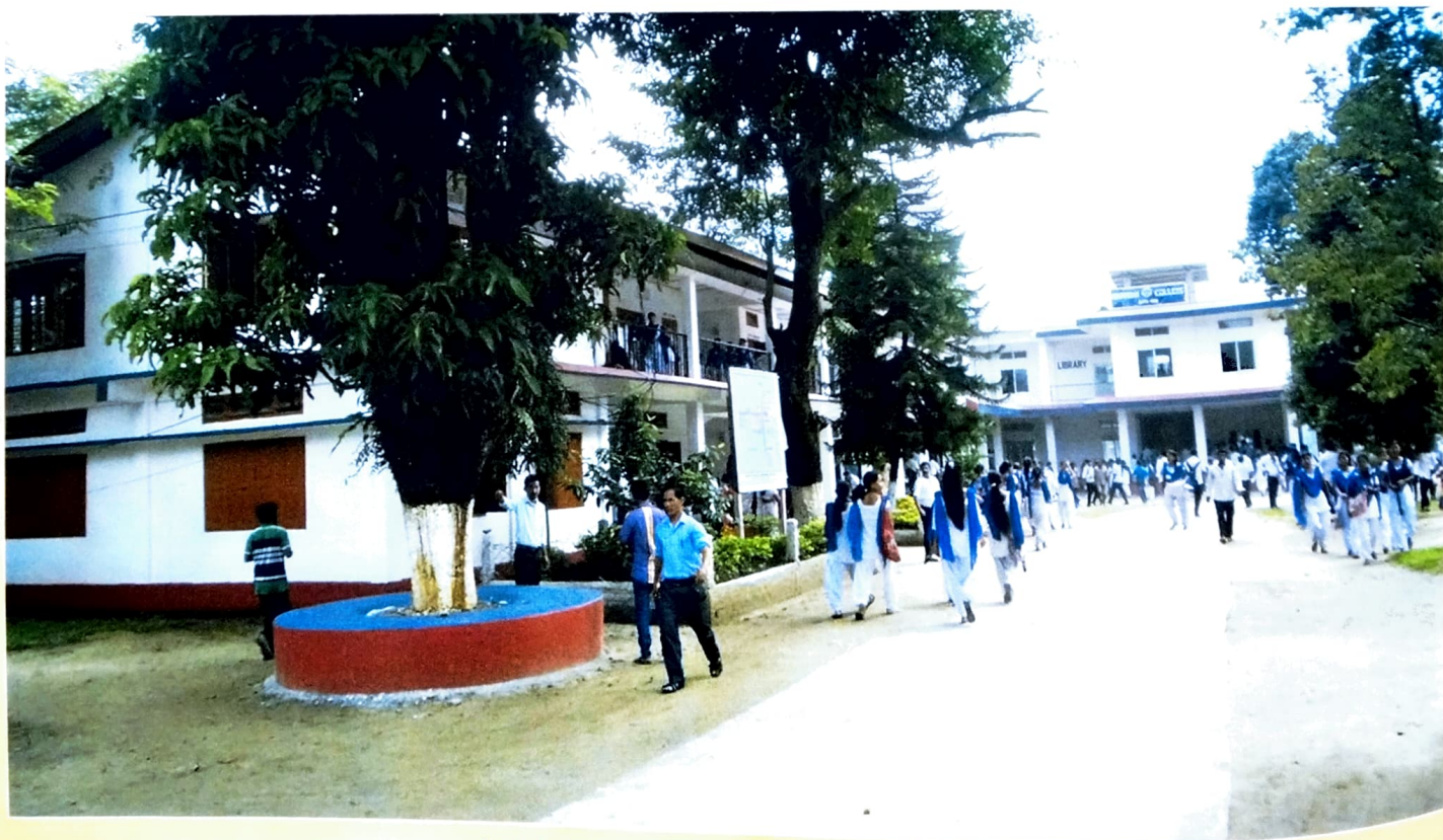
A picturesque view of the College Campus

The College authority offers Remedial Course to academically disadvantageous and backward community students belonging to scheduled caste and scheduled tribe in order to help them to cope up with academic advantage.