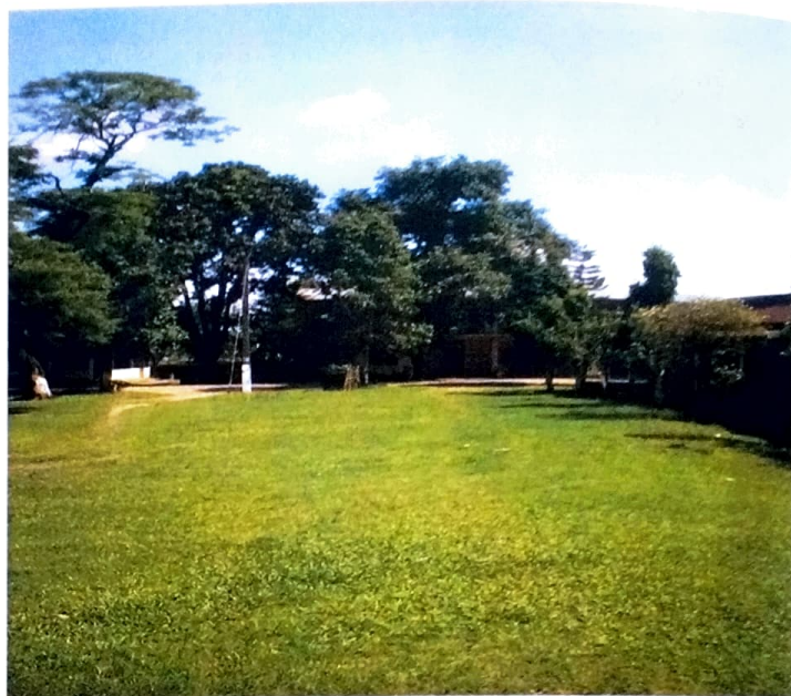
A Green yard in front of the Administrative Building