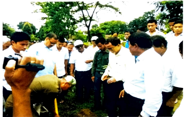
An ongoing preparation for plantation in the College Campus.