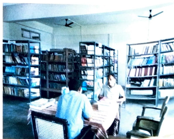
A partial view of College Library.