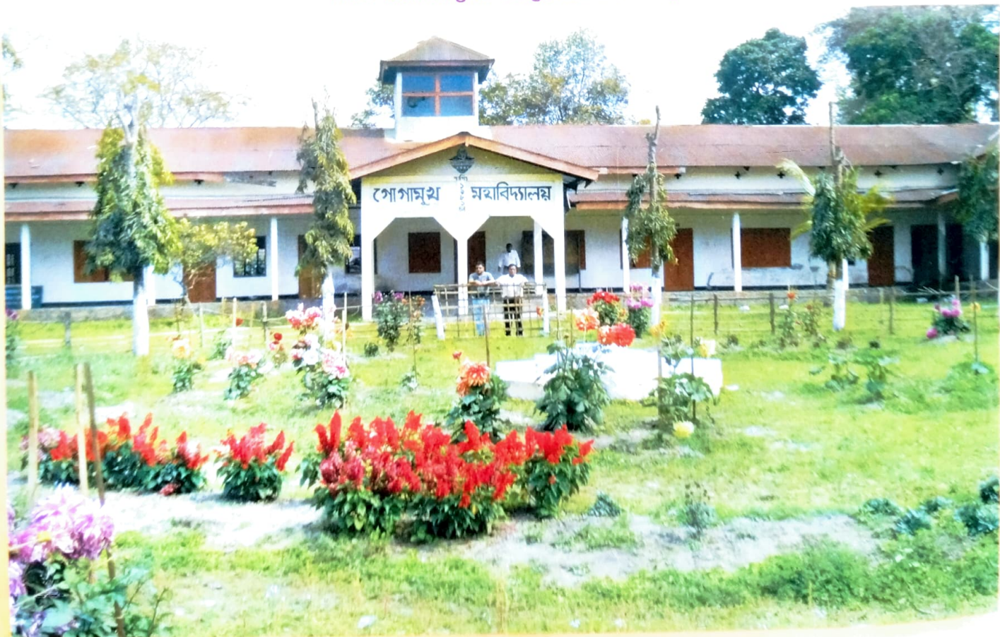
Old Building of Gogamukh College