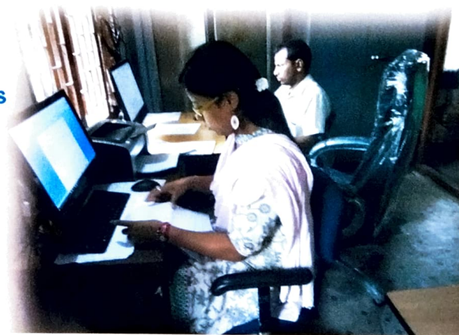
Computer works of the College are done here