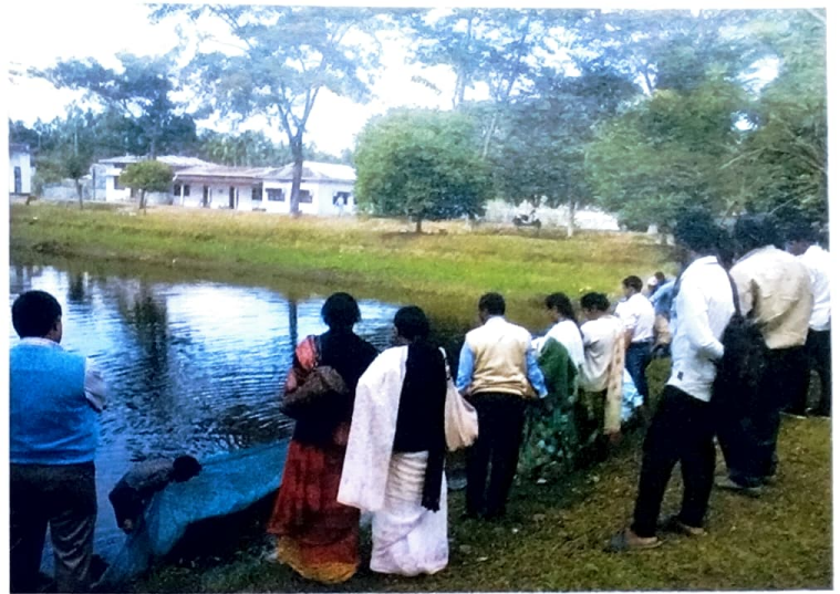
Fishing at College Fishery

gmkc1981@gmail.com info@gogamukhcollege.net library@gogamukhcollege.net iqac@gogamukgcollege.net kkhsou@gogamukhcollege.net