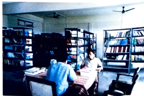
A partial view of our College Library

On application to the Principal, financial assistance will be granted to the poor and meritorious students to purchase books and other materials.