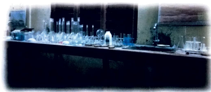
Chemistry Laboratory of the College