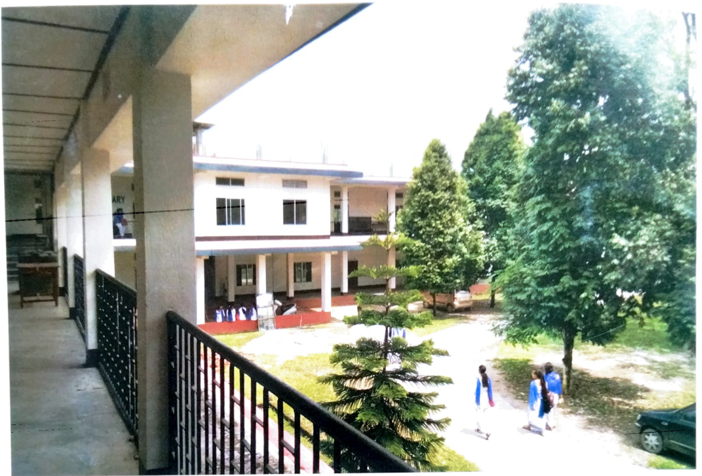
New Building of Gogamukh College