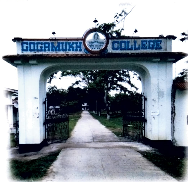
Welcome to Gogamukh College

(2% seats reserved for extra curricular Activities Quota. The College reserves the right to grant / deny admission to any student in this category.