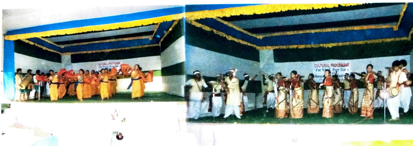
Moments of Cultural Programmes in the College Auditorium