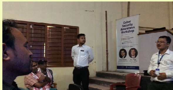
Awareness Programme on Cyber Crime in collaboration with Gratia Technology Pvt. Ltd, Guwahati.