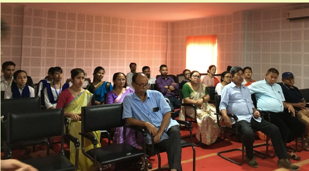
DIGITAL CONFERENCE ROOM