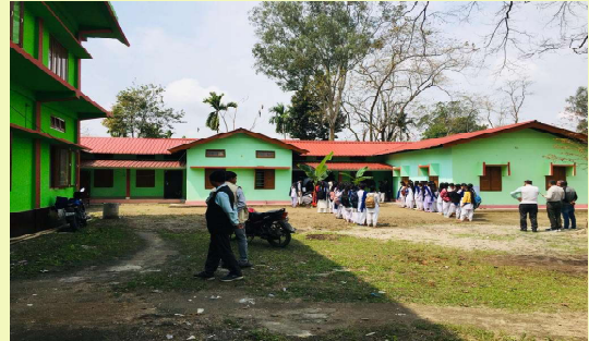
GIRLS' HOSTE CAMPUS