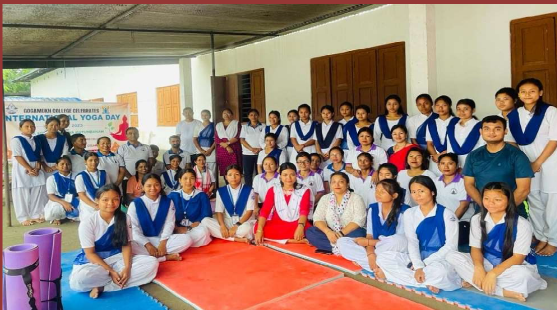
POST PHOTO SESSION ON CELEBRATION OF INTERNATIONAL YOGA DAY