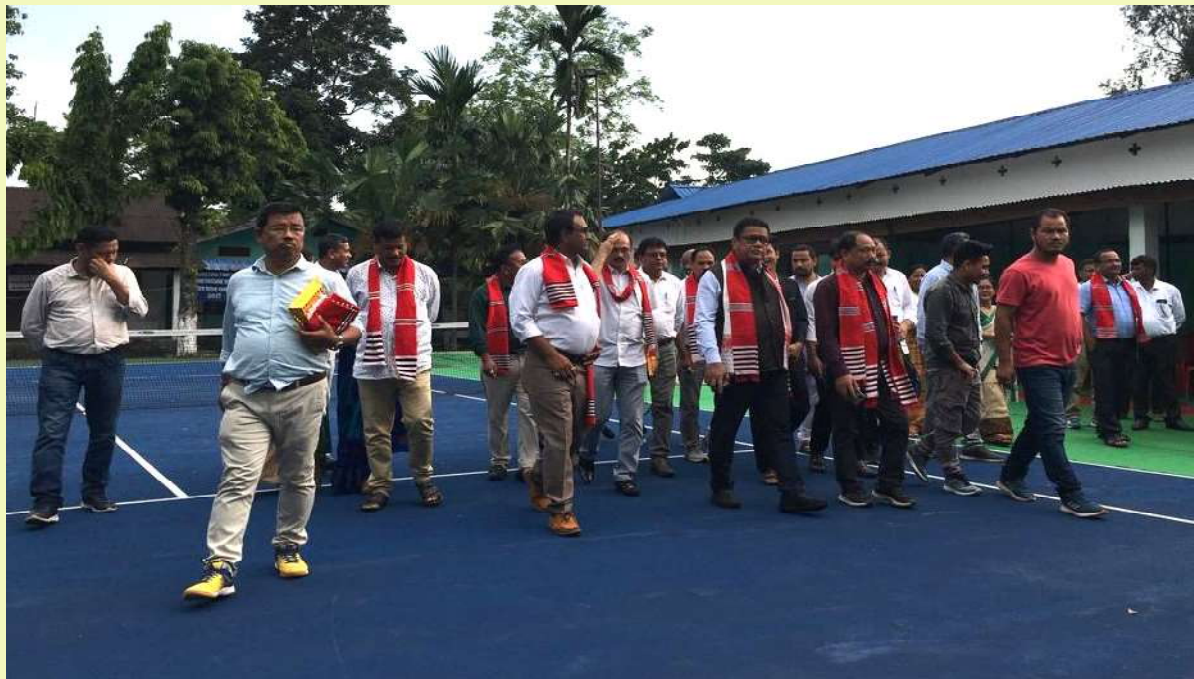
Dr. Ranoj Pegu, Hon'ble Education Minister of Assam after opening the Gogamukh College Tennis Court (Hard).