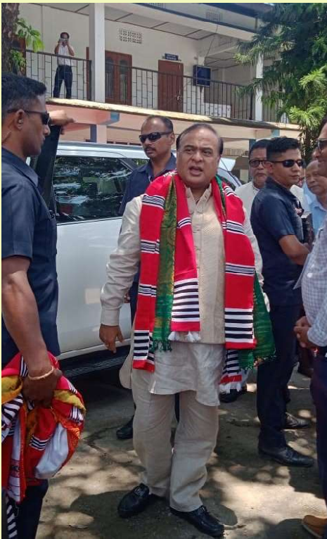
Dr. Himanta Biswa Sharma Hon'ble Chief Minister of Assam visited the College.