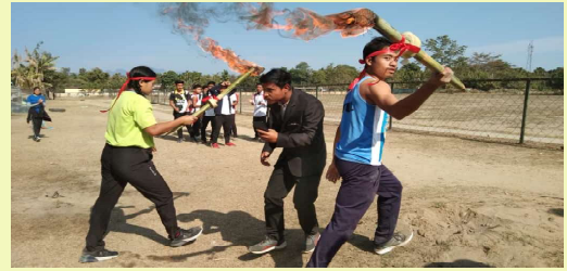
Olympic Flame carry over to open the Sports Week