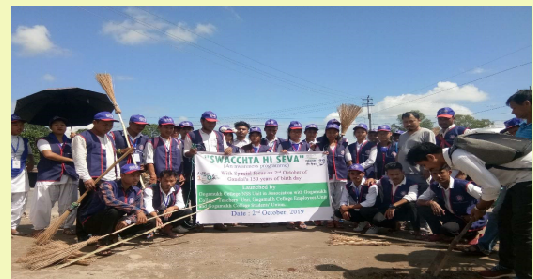
'Swacchta Ki Sewa' Aviyan