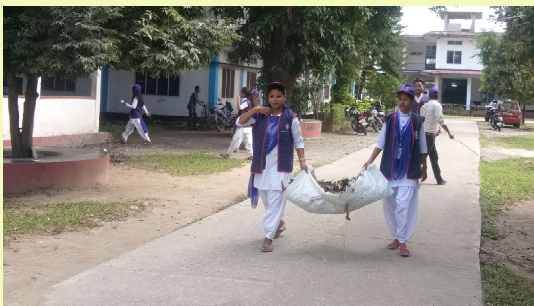
Clean Drive Programme at College Campus by NSS Volunteers