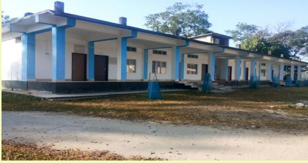
This building is well equipped assigned for Office of the KKHSOU, DODL and two Digital Class Room.