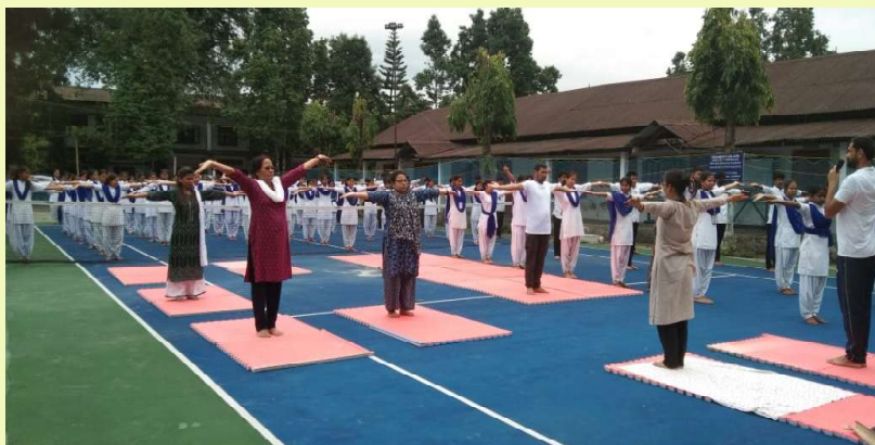
Gogamukh College Yoga Students exercise Yoga in association with Rudraksh Yoga Vignyan Mahavidyalaya at College Campus.