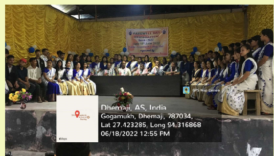
A Farewell Session