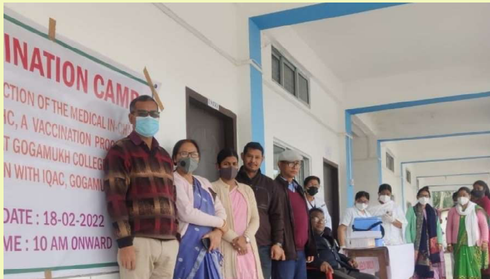
Covid-19 Vaccination Camp